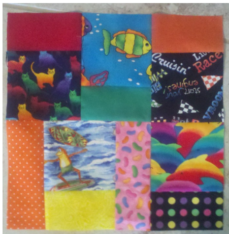
Here's another view using different fabrics